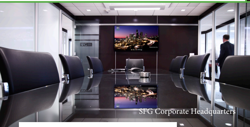
SFG Corporate Headquarters

the better pricing offered by fund-based lenders, and banks can’t compete with the flexibility and speed at which fund-based lenders make deals happen. These days, sophisticated fund based lenders and banks work together synergistically to better serve the needs of the borrowing community.