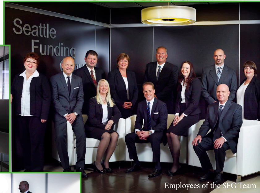
Employees of the SFG Team