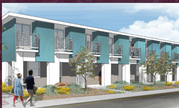
Student Housing Project by the U of A Tucson, AZ $7,200,000