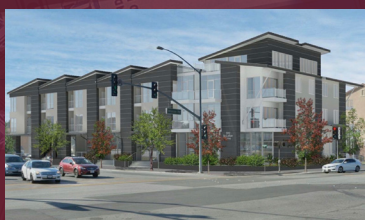
24-Unit Mixed-Use Construction Project San Francisco, CA $7,500,000

REAL ESTATE CAPITAL AT THE SPEED OF BUSINESS® CALL SEATTLE FUNDING GROUP