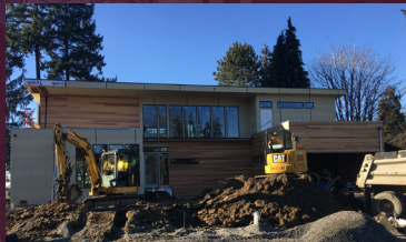
Boutique Builder in Core Location Mercer Island, WA $1,400,000