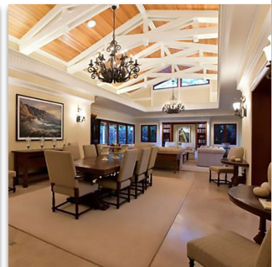
$8,500,000 Two Oahu Waterfront Estates KAILUA, HI