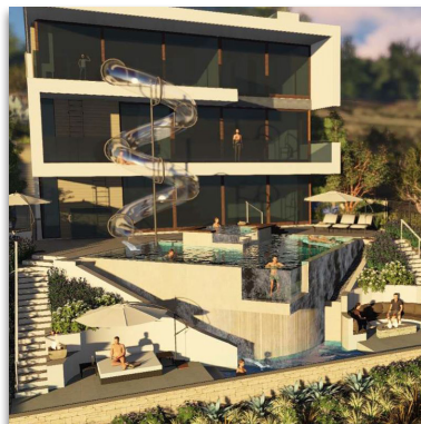
$3,100,000 Ocean Front Lot DANA POINT, CA