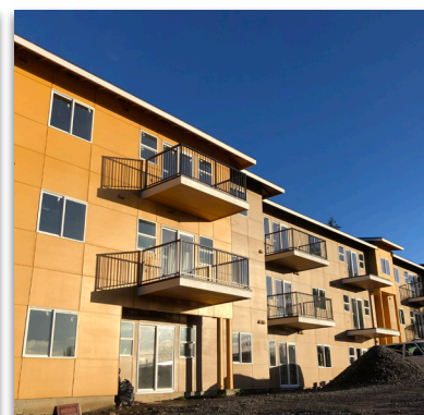
$5,250,000 32-Unit Apartment Complex BURIEN, WA