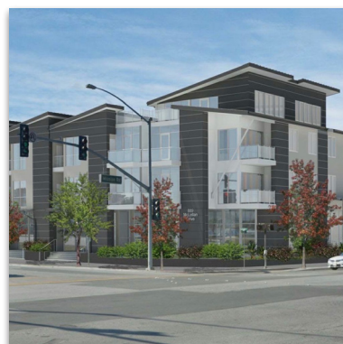
$7,500,000 24-Unit Mixed Use Project SAN FRANCISCO, CA