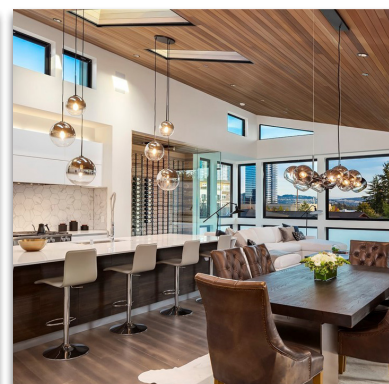
$2,700,000 Construction of Luxury Home SEATTLE, WA

"Finest private money I've ever worked with. They really know how to make a deal come together."