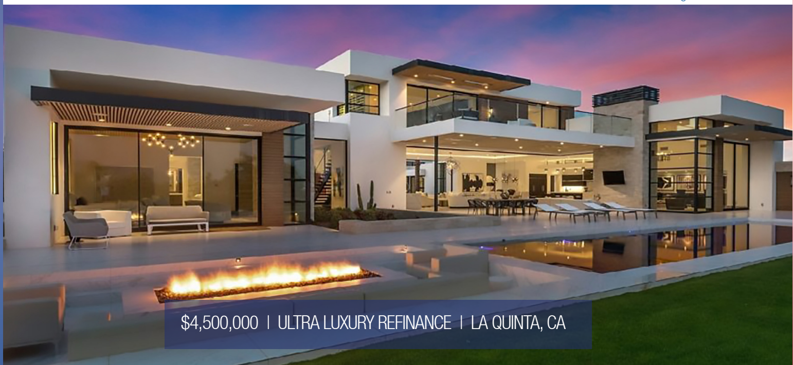
$4,500,000 | ULTRA LUXURY REFINANCE | LA QUINTA, CA