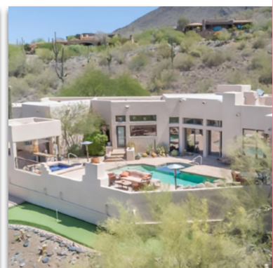
$525,000 Vacation Rental Property CAVE CREEK, AZ