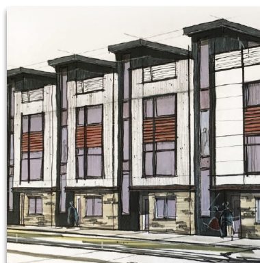
$4,700,000 Nine Executive Town Homes DENVER, CO