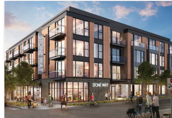
FUTURE SITE OF 48-UNITS $3,200,000 SEATTLE, WA