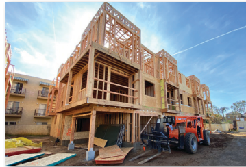
EIGHT TOWNHOMES $5,250,000 CARLSBAD, CA