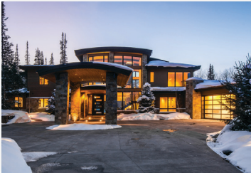
LUXURY SKI SFR $3,360,000 PARK CITY, UT