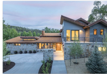
MODULAR SFR $2,100,000 TELLURIDE, CO