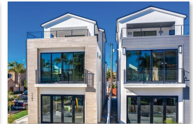
TWO BEACH SPEC HOMES $2,690,000 HUNTINGTON BEACH, CA