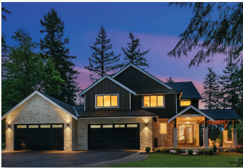
UPSCALE SPEC SFR $1,725,000 MAPLE VALLEY, WA