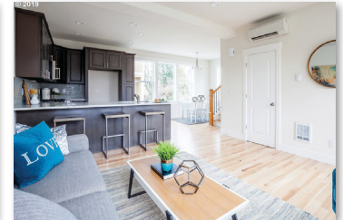
EIGHT TOWNHOMES $2,100,000 PORTLAND, OR

"Seeing a deal through early and getting right back to you with a fast answer is what you can count on when you bring a transaction to SFG."