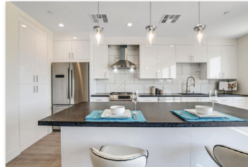
EIGHT TOWNHOMES $1,910,000 TEMPE, AZ