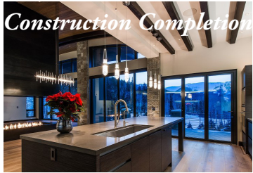
$3,360,000 61% LTV Park City, UT

This experienced builder capitalized on this well located infill location in Madison Valley, constructing a 6 townhome community.