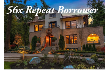
$1,260,000 60% LTV Mercer Island, WA

The highly experienced veteran team built an 8,600 SF golf course-front spec with terrific contemporary design & exceptional southwesterly views. The home is turnkey, with 5 bedrooms, 6 1/2 baths, pool, and spa. Sold for $8m.