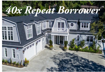
$2,105,000 60% LTV Clyde Hill, WA

The builder constructed a luxury home in Park City, UT at the prestigious ski community, Park City Mountain Resort. This high-end spec home features 5 bedrooms, 6 baths, a heated driveway, and mountain views.