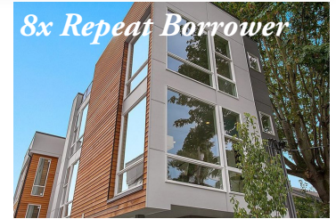
$2,730,000 64% LTV Madison Valley (Seattle), WA

Apex Elite Homes specializes in luxury spec home construction projects in strategic, core locations. This home features 7 bedrooms, 7 baths and is over 6,400 SF.