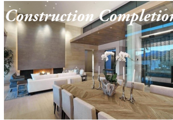
$3,450,000 57% LTV La Quinta, CA

This home is over 6,200 SF, featuring 5 bedroom suites, main floor GenSuite, and spacious outdoor room. BDR Homes continues to be a leader in residential construction, producing exceptional quality buyers can count on.