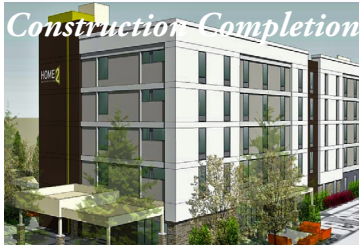
$5,000,000 35% LTV Marysville, WA

SFG's long time in-house construction department provides builders faster response times for draw requests & an overall exceptional experience.