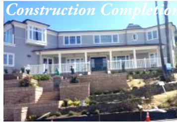
$3,250,000 67% LTV La Jolla, CA

Construction needed to begin immediately to meet the grand opening deadlines of the franchise agreements. SFG provided a first position loan to complete the construction budget nearing $15m.