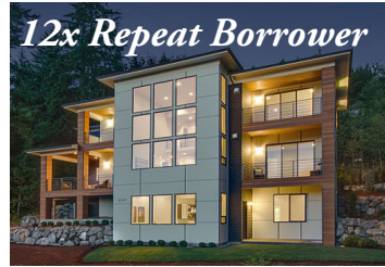
$988,000 49% LTV Bellevue, WA

This property sat in an increasingly dilapidated state for years. Greatly aiding the process was the project team bringing development strength & expertise necessary to augment the owner's experience on this 6,100 SF spec house.