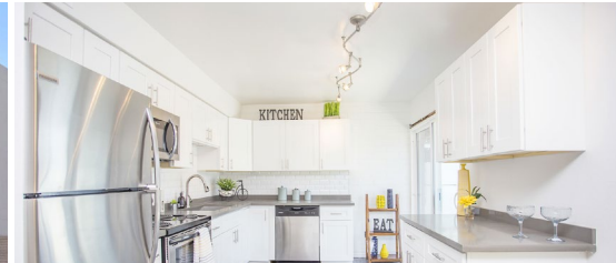
$2,400,000 APARTMENT COMPLEX IN CAMELBACK CORRIDOR PHOENIX, AZ