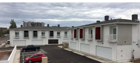
$7,200,000 STUDENT HOUSING PROJECT BY U OF A TUCSON, AZ