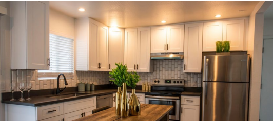
$1,273,000 10 UNIT APARTMENT RENOVATION PROJECT PHOENIX, AZ