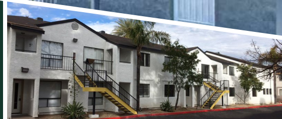
$2,222,500 22-UNIT APARTMENT COMPLEX IN ARCADIA LITE PHOENIX, AZ

REAL ESTATE CAPITAL AT THE SPEED OF BUSINESS®