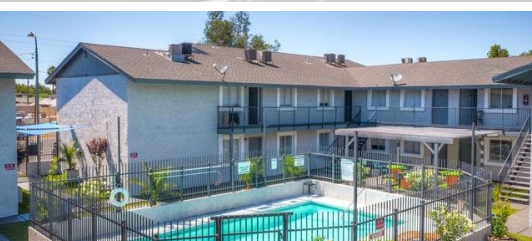
$1,750,000 10 DAY CLOSING ON 48-UNIT COMMUNITY PHOENIX, AZ