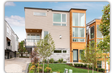
SIX TOWNHOME PROJECT $3,200,000 KIRKLAND, WA