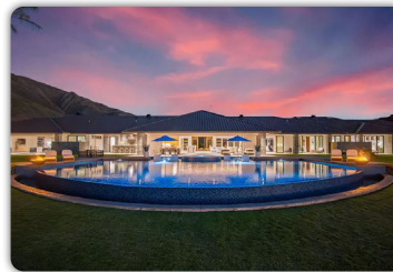
REPEAT BUILDER CONSTRUCTION $4,735,000 LAHAINA, HI