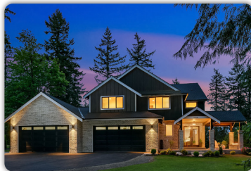
LOCAL REPEAT BUILDER $1,725,000 MAPLE VALLEY, WA