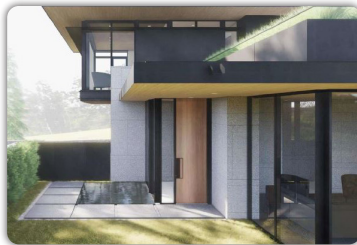
LUXURY SPEC CONSTRUCTION $4,900,000 MEDINA, WA