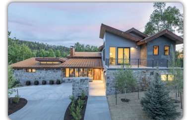
TELLURIDE MODULAR SFR BUILD $2,100,000 MOUNTAIN VILLAGE, CO

"Seeing a deal through early and getting right back to you with a fast answer is what you can count on when you bring a transaction to SFG."