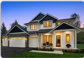
UPSCALE SPEC SFR $990,000 RENTON, WA