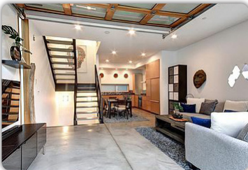
42-UNIT APARTMENT BUILDING $5,850,000 SEATTLE, WA