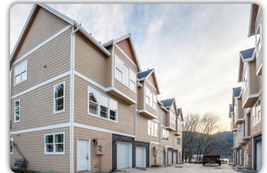
EIGHT TOWNHOMES $2,100,000 PORTLAND, OR

"Seeing a deal through early and getting right back to you with a fast answer is what you can count on when you bring a transaction to SFG."