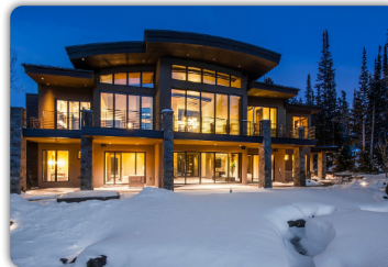
LUXURY SKI SFR $3,360,000 PARK CITY, UT