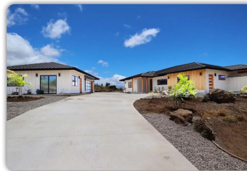
SPEC SFR WITH TERRIFIC VIEWS $660,000 KAMUELA, HI