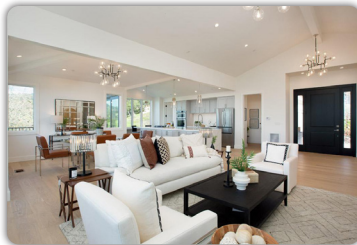
EIGHT TOWNHOMES $5,250,000 CARLSBAD, CA