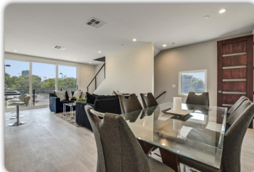
EIGHT TOWNHOMES $1,910,000 TEMPE, AZ