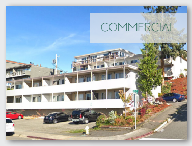
$9,200,000 KIRKLAND, WA PRIME DOWNTOWN APARTMENT COLLECTION ON LAKE WASHINGTON BLVD.