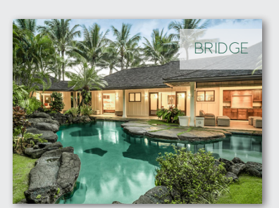
$8,500,000 KAILUA, HI TWO SUPER LUXURY HOMES IN CASTLE POINT ESTATES