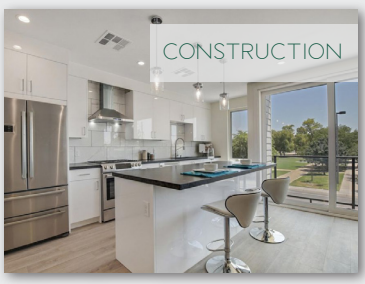
$1,910,000 TEMPE, AZ EIGHT TOWNHOME COMMUNITY BLOCKS FROM ASU CAMPUS