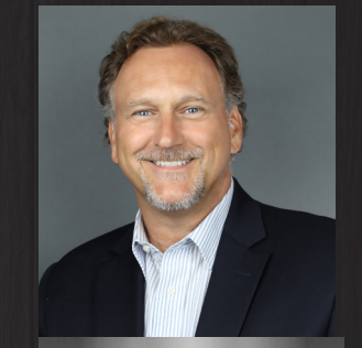
WITH SFG SINCE 2020