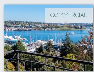
$5,800,000 SEATTLE, WA MULTIFAMILY COMPLEX WITH 180° VIEWS OF LAKE UNION