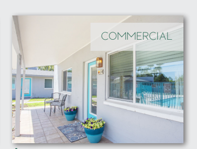
$2,400,000 PHOENIX, AZ SOUGHT-AFTER MULTIFAMILY IN CAMELBACK CORRIDOR