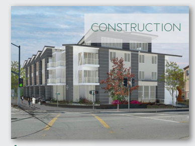
$7,500,000 SAN FRANCISCO, CA 24-UNIT MIXED-USE PROJECT ACROSS FROM BART STATION