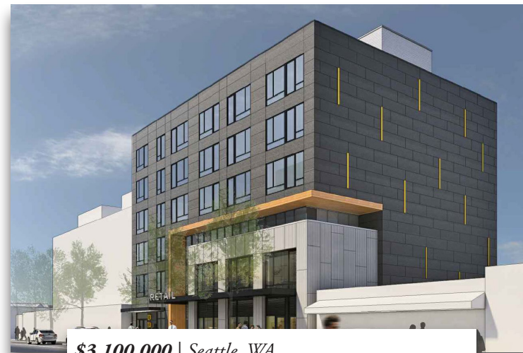
$3,100,000 | Seattle, WA Experienced foreign national developer purchased this 59 unit fully entitled apartment site on University Way in Seattle close to the University of Washington. 50% LTV