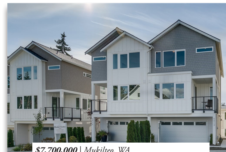
$7,700,000 | Mukilteo, WA Repeat borrower and experienced developer approached SFG once again for financing to complete phase two and begin phase three of new condo flat construction in Mukilteo. 72% LTV