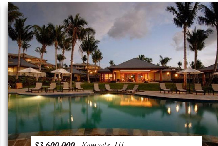
$3,600,000 | Kamuela, HI This highly experienced builder/developer and his veteran team are building a 5,500+ sqft home to be listed in excess of $7.5 Million. 56% LTV