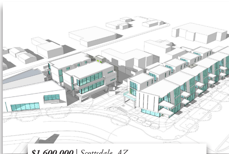
$1,600,000 | Scottsdale, AZ Borrower approached SFG through his broker and had a short window of opportunity to purchase his partner's 50% interest in this dynamic location in the heart of Scottsdale. 47% LTV