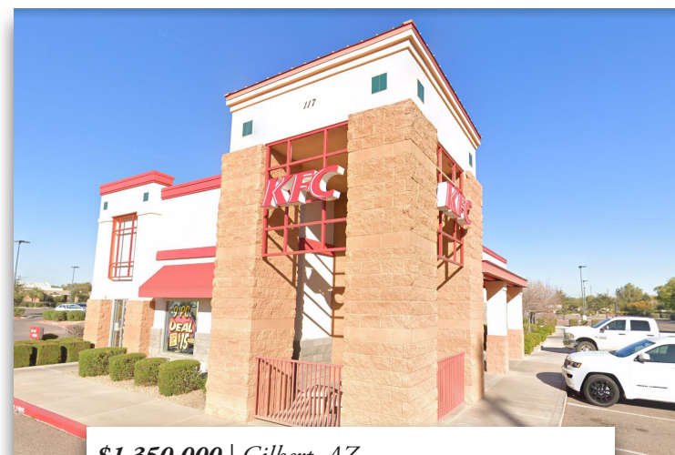
$1,350,000 | Gilbert, AZ Working diligently with Sponsorship, Broker and SFG's experienced underwriting and closing team, this time sensitive transaction made it to the finish line on time. 67% LTV