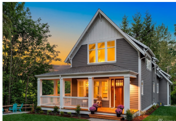
$520,000 65% LTV Issaquah, WA

Highly experienced builder and his veteran team constructed a 5,688 sq. ft. home featuring 5 BR, 5 BA on a 28,000 sq. ft. lot.