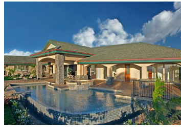
$2,400,000 45% LTV Lahaina, HI

50+ time repeat builder constructed a 4,400 sq. ft. luxury farm house in the highly coveted neighborhood of Mercer Island.