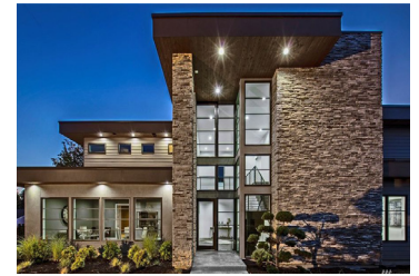
$1,825,000 49% LTV Clyde Hill, WA

This spectacular residence is located at the top of the prestigious Pinnacle Kaanapali gated community and offers vast ocean views from every room.