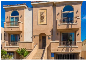
$3,000,000 65% LTV Valley Village, CA

SFG's long time in-house construction department provides builders faster response times for draw requests and an overall exceptional experience.