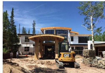
$3,360,000 60% LTV Park City, UT

SFG of CA provided construction financing for three cloud condos in coastal Solana Beach. The location offers high walkability to dining and shopping.