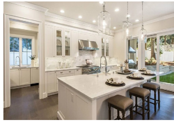
$1,800,000 62% LTV Mercer Island, WA

Affordably priced and well sponsored 10 unit condominium construction outside of Studio City.