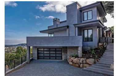
$1,860,000 62% LTV Santa Barbara, CA

Builder constructed a luxury home in the prestigious ski community, Park City Mountain Resort. The builder needed deal certainty before the weather began to change and turned to SFG.