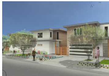
$3,300,000 58% LTV Solana Beach, CA

Custom construction of an elegant northwest farmhouse in the quiet suburb of Issaquah. The property is located just minutes from the thriving old town with popular shops and dining.